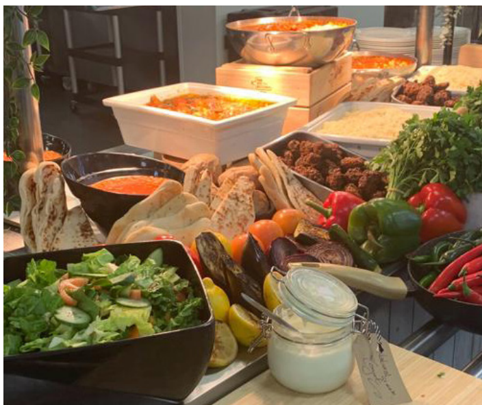
Our amazing Balti House curry day!