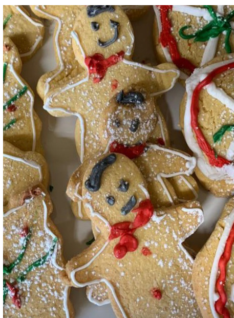
Festive biscuit treats are always enjoyed...