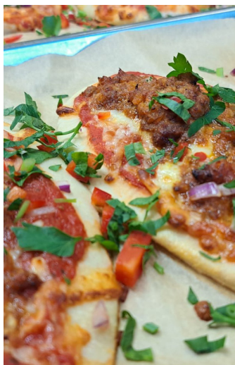
Hand stretched fresh pizza every day.