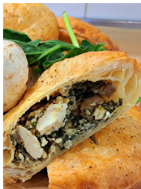
Fresh handheld bakes when you need something on the go!