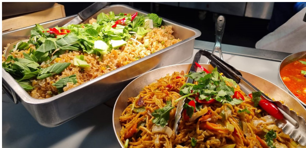
Celebrating Chinese New Year with some authentic noodle and rice dishes.....