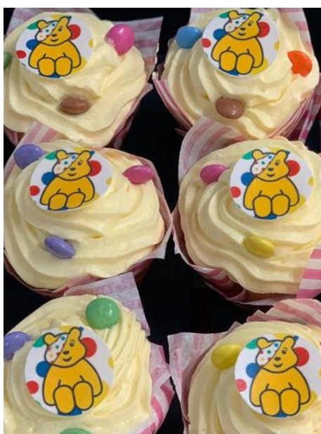
Supporting a great charity with Children in Need..