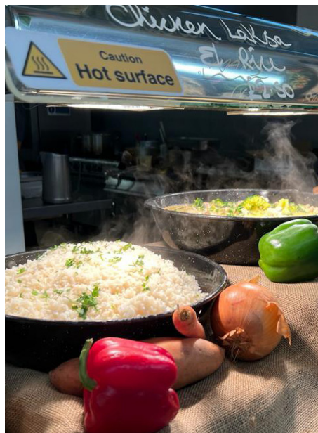
Chicken Laska a Wokamoma favourite!