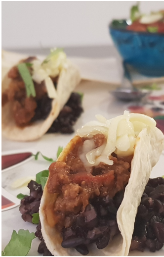
Soft shell tacos for Taco Tuesday