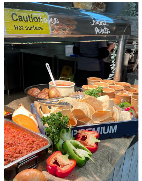
Low and slow cooked chilli-con-carne