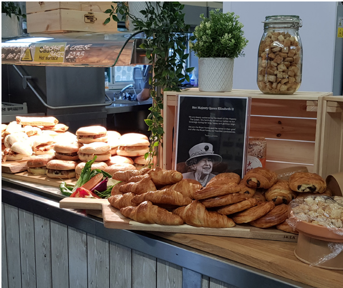
Breakfast pastries and bacon and sausage rolls