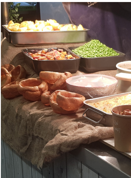
Roast day with giant Yorkshire puddings