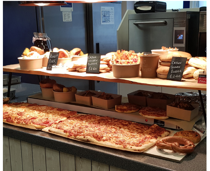
Sourdough pizza in the 6th form