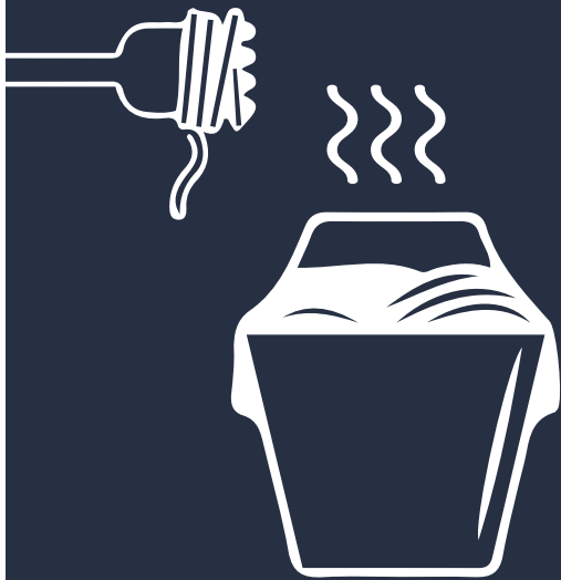
HOT PASTA POT (120Z)

Make your money go further with this meal deal!