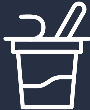
CLASSIC DESSERT POT